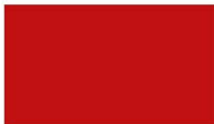
Traffic Red (near to RAL 3020)