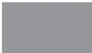
Signal Grey (near to RAL 7004)

The applied colours may differ slightly from the examples shown above. Contact our customer services for a true colour sample or a special colour match. Special corporate colours and designs can be produced to special order.